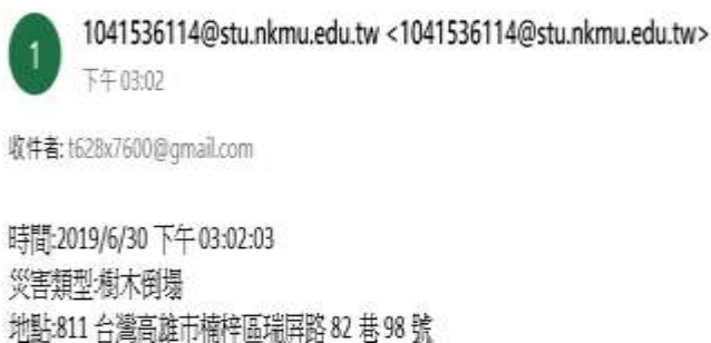
Fig -4: Information of the accident