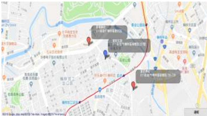
Fig -2: Information of map

the automatic notification system is added in order to help the victims when no one is around.