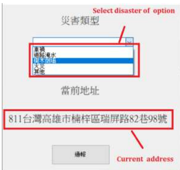
Fig -3: Notify disaster