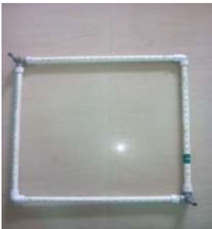
Fig. No. 4.3 PVC pipes

Polyvinyl chloride, also called Polychloroethene or PVC, is a thermoplastic. It soft when heated and hard when cooled. Polyvinyl chloride is made by polymerization of the monomer vinyl chloride (chloroethene) \text{CH}_2=\text{CHCl} . PVC can be made softer and more flexible by adding plasticizers. Phthalates are often used to soften PVC in this way.