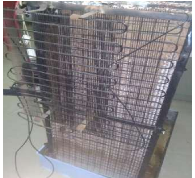
Fig No. 4.10 Condensor

In systems involving heat transfer, a condenser is a device or unit used to condense a substance from its gaseous to its liquid state, by cooling it. In so doing, the latent heat is given up by the substance and transferred to the surrounding environment. Condensers can be made according to numerous designs, and come in many sizes ranging from rather small (hand-held) to very large (industrial-scale units used in plant processes).