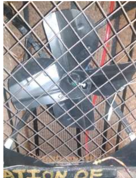
Fig.no.4.1 mechanical fan

A mechanical fan is a machine used to create flow within a fluid, typically a gas such as air. The fan consists of a rotating arrangement of vanes or blades which act on the fluid. The rotating assembly of blades and hub is known as an impeller, a rotor, or a runner. Usually, it is contained within some form of housing or case this may direct the airflow or increase safety by preventing objects from contacting the fan blades. Most fans are powered by electric motors, but other sources of power may be used, including hydraulic motors and internal combustion engines. Fans produce flows with high volume and low pressure (although higher than ambient pressure), as opposed to compressors which produce high pressures at a comparatively low volume. A fan blade will often rotate when exposed to a fluid stream, and devices that take advantage of this, such as anemometers and wind turbines, often have designs similar to that of a fan.