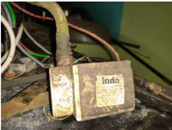
Fig. no. 4.5 Pump

Pump is the pressure buster. We used 2 small sized centrifugal pumps. Pump in our project is used to supply water from lower tank to PVC pipe through which water the distributed to various section of evaporative pads.