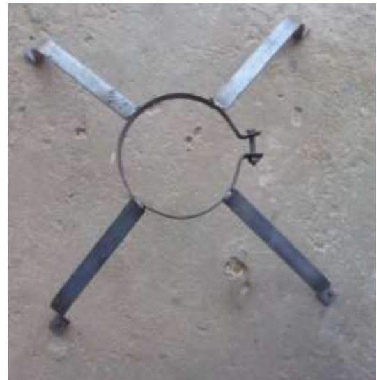
Fig. No. 4.7 BRACKET

Bracket used in our project is as shown in fig. Bracket is used to support motor.