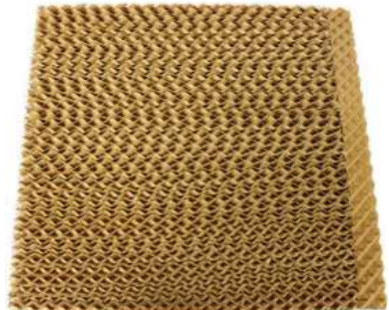
Fig.no. 4.4 evaporative pad cooling system

The typical evaporative pad cooling system draws outside air into the building through wet vertical pads. The major components of this system are: pad media, water supply, pump, distribution pipe, gutter, sump, and bleed-off line. As air flows past the moist pad