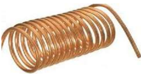
Fig:-4.9 capillary tube

A capillary tube is a long, narrow tube of constant diameter. The word “capillary” is a misnomer since surface tension is not important in refrigeration application of capillary tubes. Typical tube diameters of refrigerant capillary tubes range from 0.5 mm to 3 mm and the length ranges from 1.0 m to 6 m.