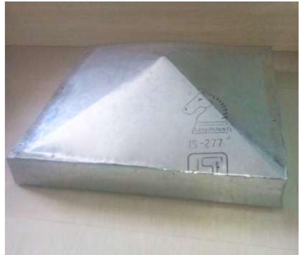
Fig.no. 4.6 Distractor