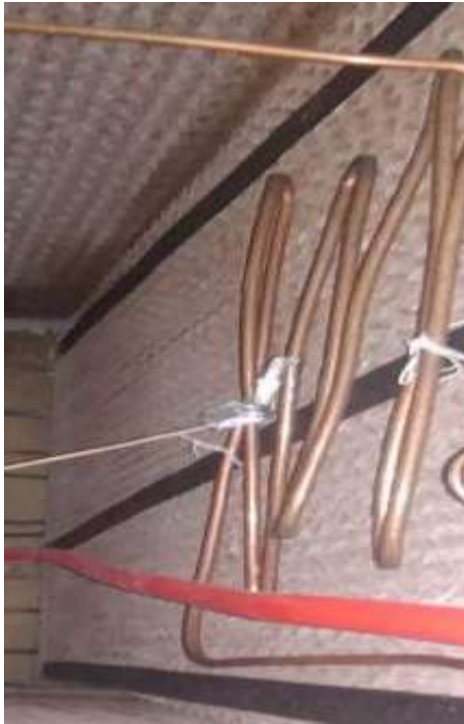
Fig No. 4.8 Copper coil.