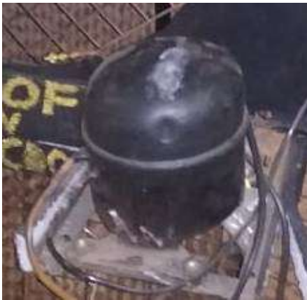
Fig.no. 4.2 compressor

A compressor is a mechanical device that increases the pressure of a gas by reducing its volume. An air compressor is a specific type of gas compressor.