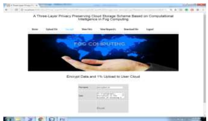
Fig 4: Encryption of File into Three Layer