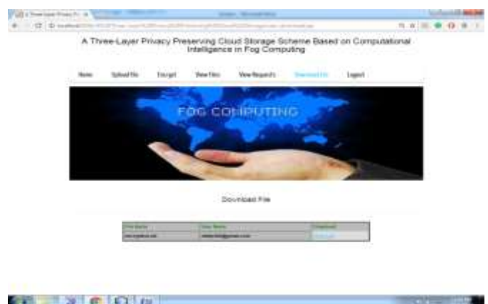
Fig 5: File Download