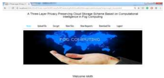
Fig 3: User Home Page