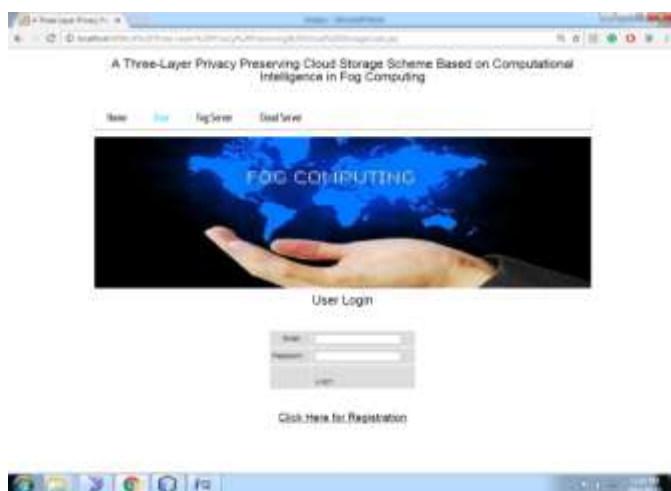
Fig 2:User Login