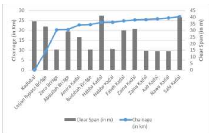
Graph 6. Jhelum - Chainage vs Clear Span