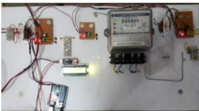
Fig 2. working model of proposed system

The measured current will be compared by using Arduino programming as per the conditions. If the results is negative then the warning SMS is send to MSCDCL engineer and consumer as “EXCESSIVE USAGE OF ENERGY”. The message will be sent through GSM technology from the output of Arduino to LCD display and then LCD will display the final results. Relay will perform its operation by tripping and the supply will be cut off. MSCDCL can also trip the circuit by sending the signal to GSM.