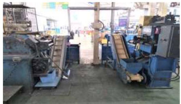
Fig.1 Expander unit and Tab blanker machine.

Tab blanker Machine:- The finally formed grids by expander units is goes to the tab blanker machine. On this machine we are putting the knuckle end to the grid plate and remaining scrap is removed with the help of blanker, again this removed scrap is carried away with the help of hopper and conveyer arrangement. The scrap removed from the Expander unit and tab blanker machine is collected in the container through the conveyer and then it id recycle in the furnace.