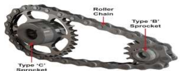
Fig.7 Power transmission mechanism

Power transmission is done by a belt and pulley transmission system. Here, different pulleys are used for speed variation to get a variable distance between two seeds. The belt is shifted from one pulley to another to achieve the required distance between two seeds. The main power of the machine is available from the wheels of the machine. Once a person pushes the machine, the wheels rotate according to the speed of the machine. The wheels transmit power through the power transmission mechanism as shown in figure 7.