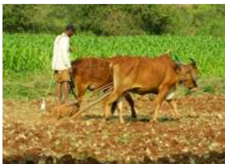
Fig.1 Line sowing

It is the dropping of seeds into the soil with the help of implement such as mogha, seed drill, seed-cum-ferti driller or mechanical seed drill as shown in figure 1. Crops like Jowar, wheat Bajara, etc. are sown by this method.