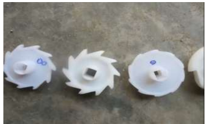
Fig.6 Seed sowing disc & seed bucket

The disc which is attached at the bottom of the tank allows one seed during one rotation of the wheel. In the above figure, the seed sowing disc is also included as shown in figure 6. The buckets are screwed onto the disc. These buckets are very similar to the half-shape of Pelton buckets. As they are screwed to the disc, their size is varied according to the diameter of the seed and the required distance between the seeds.