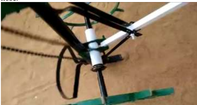
Fig.4 Digger mechanism:

Digger mechanism is used for digging and seeding. The digger itself is used as a digging tool. The digger is connected to the frame by a nut and bolt. There are three adjustable diggers as shown in figure 4. A digger has a flapper for opening into the cavity for seeding. The flapper is connected to the hopper with the help of a hose.