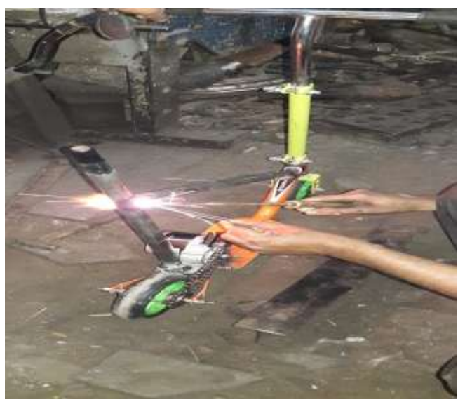
Fig -2: Arc Welding

Arc welding is a welding process that is used to join metal to me tal by using electricity to create enough heat to melt metal, and the melted metals when cool result in a binding of the metals. Gas metal arc welding (GMAW), sometimes referred to by its subtypes metal inert gas (MIG) welding or metal active gas (MAG) welding, is a welding process in which an electric arc forms between a consumable MIG wire electrode and the work piece metal(s), which heats the work piece metal(s), causing them to melt and join.