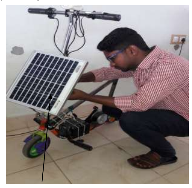
Fig-5: Solar panel

Lithium-particle batteries can be a wellbeing peril since they contain a combustible electrolyte and may move toward becoming pressurized on the off chance that they become harmed. A battery cell charged also rapidly could cause a short out, prompting blasts and flames. On account of these dangers, testing gauges are more stringent than those for corrosive electrolyte batteries, requiring both a more extensive scope of test conditions and extra battery-explicit tests, and there are shipping impediments forced by wellbeing controllers.