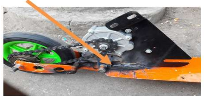
Figure 1: Arc Welding

© 2019, IRJET | Impact Factor value: 7.211 | ISO 9001:2008 Certified Journal | Page 3697