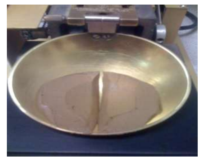
Fig.2 Liquid Limit Apparatus

Plastic limit is defined as minimum water content at which soil remains in plastic state. The plasticity index is defined as the numerical difference between its Liquid limit and Plastic limit.