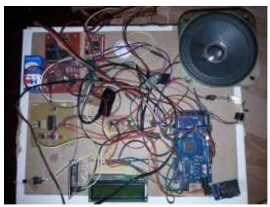
Fig-8 Implementation of the Proposed System

The drug update framework serves dependable updates, has a decent and simple to utilize UI and supports a great deal of highlights clinging to medications. The medication update box isn't at all confounding and can be effectively comprehended by the client. The best piece of the application is that the time must be entered just once. On presenting the Time once, the information is matched up; This takes into consideration simple updates and helps the patient in taking his pill effectively.