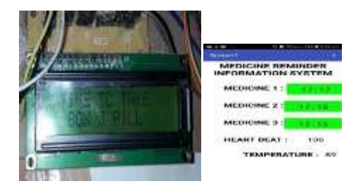
Fig-6 Time for Pill 3 Fig-7 Pill 3 Taken

Fig 5 shows the LCD displaying information about pill i.e "Time to take Box 2 pill" and fig 5 shows that the patient has taken his pill which is indicated by the green color of second bar.