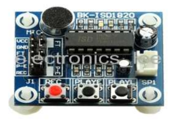
Fig. ISD 1820 Voice module.

It can offers true single-chip voice recording, no-volatile storage, and playback capability for 8 to 20 seconds. The sample is 3.2k and the total 20s for the Recorder. This module use is very easy which you could direct control by push button on board or by Microcontroller such as Arduino, STM32, ChipKit etc. Frome these, you can easy control record, playback and repeat and so on.