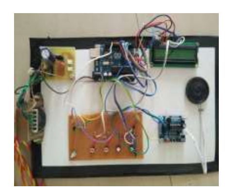
Fig. Proposed system for Deaf-Dumb people