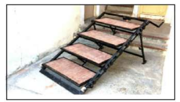
Fig:2 Fabricated Stairs

It consists of main body which is a right angle triangle support structure which holds and supports all the parts. All the load of the body and element is sustained by adjustable stand. Motion to the treads is provided with the help of worm gear, which are mounted over the worm rod, which is supported by the bearings at both ends. Each worm is locked with the help of keys at particular distance, motion carried by worm is then transfer to the spur gear. Spur gear motion is directly translated to the motion of the treads.