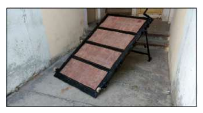
Fig:3 Converted Ramp.

gained by the worm which is meshed with the spur gears. As the spur gear is attached with tread rod the same motion is obtained by the tread frame and its start converting to ramp. Same time the links are also operated due to the motion of tread which give rigid construction to the stairs. On converting into stairs it is provided with the self locking system with the help of worm mechanism.