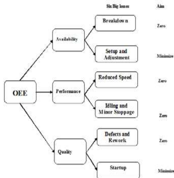
Figure 1. Overall Equipment Effectiveness Model

practice it is often difficult to determine speed losses, and a common approach is to merely assign the remaining unknown losses as speed losses.