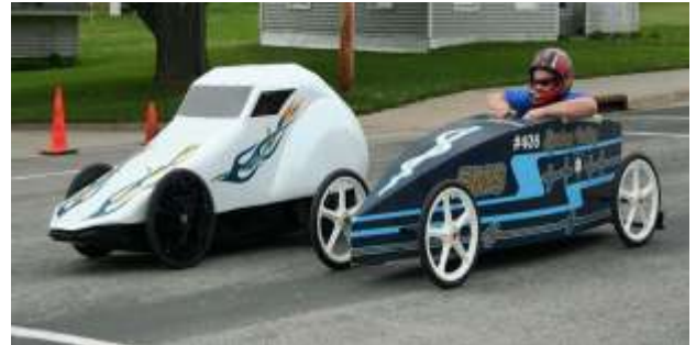
Fig. 2. A close finish. Typical “soap box” cars in action

levels out, thus it is very much important to consider all the factors of influence during event.