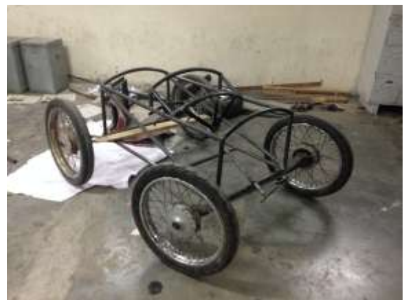
Fig.5 Built in vehicle after analysis

In Fig.5 it shows the built in vehicle after analysis or testing on different parameters of computer model in software. As per design axles of vehicles were built such a way that they can works like suspension.