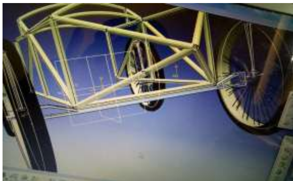
Fig.4 Computer model for SoapBox Car

A computer model of vehicle in was designed in CATIA V5R20 software. It is tested and verified and used to study the effects on predicted forward acceleration and various design parameters. Fig.4 indicates the computer design of actual soapbox vehicle which was used in the Institute Competition.