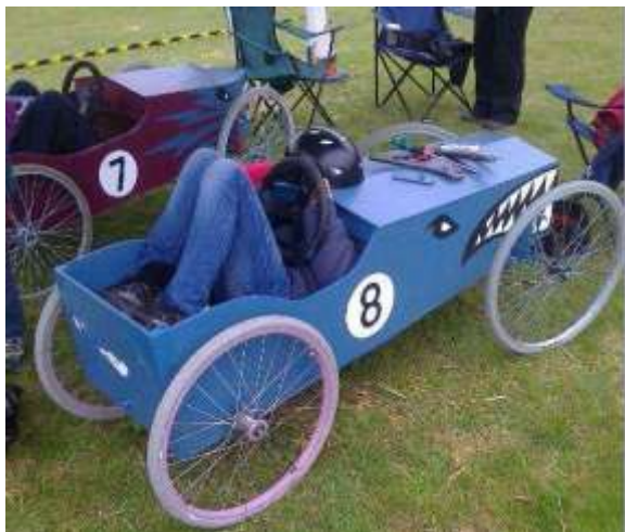
Fig.1. A typical paddock scene getting ready for the competition

Events for full size real vehicles have become popular too in this period and continue to introduce youngsters to the fun, trials and tribulations of motorsport including preparation, dealing with entries and officials, passing through technical inspection or scrutineering etc. Fig.1 shows a typical paddock scene from a recent college level event in the Uk, reminiscent of a European Formula 2 race meeting.