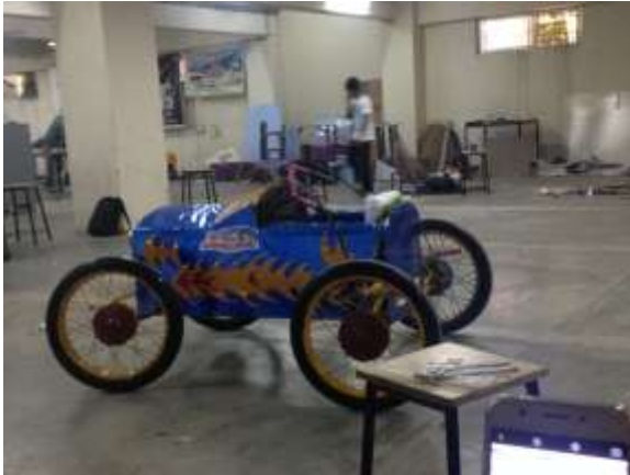
Fig.6 Suspensionless Soap Box Car