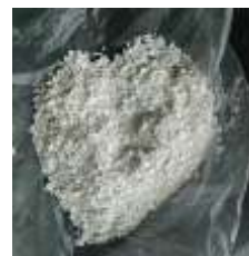
Fig1 (a. crushed eggshell

For making eggshell powder, white eggs were used and these shells were collected from the nearby bakery. After collection eggshell were washed in the flowing water and then air dried for 3-5 days at a temperature of about 20°-25°C. The shells then crushed by hands and grained in a grinding machine for obtaining a very fine powder and then sieved through 90µm IS sieve. The powder which passed through 90µm sieve was used as a cement replacement in the whole research work and material which retained on the sieve was thrown away as a waste. The properties of ESP are given below in table1.