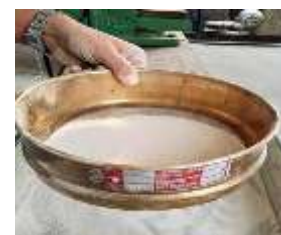
Fig1 (c. Sieving eggshell powder Through 90µ sieve