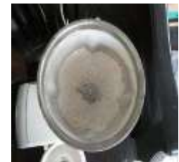
Fig1 (b. Grinding of eggshell