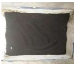
Fig2. Waste foundry sand

Waste Foundry Sand is used as earth fill materials in construction industries. It is cheapest and suitable alternative to sand. Properties of WFS depend on the metal casting process. In the present work foundry sand is collected from BOPARAI Metals Pvt. Mohali, Punjab.