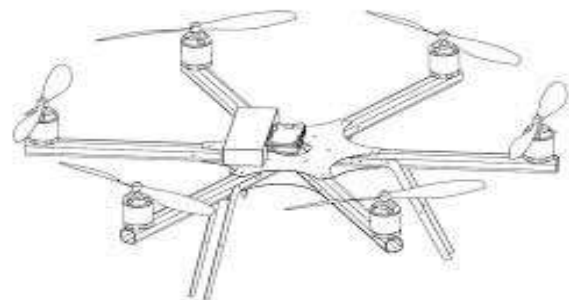
Fig-1: Basic construction of Hexacopter