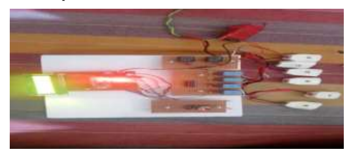
Fig 2: Testing of Hardware

Firstly we have to provide the 220v supply to the model project, after that step down transformer is used to step down the power from 220V to 5V to the circuit.