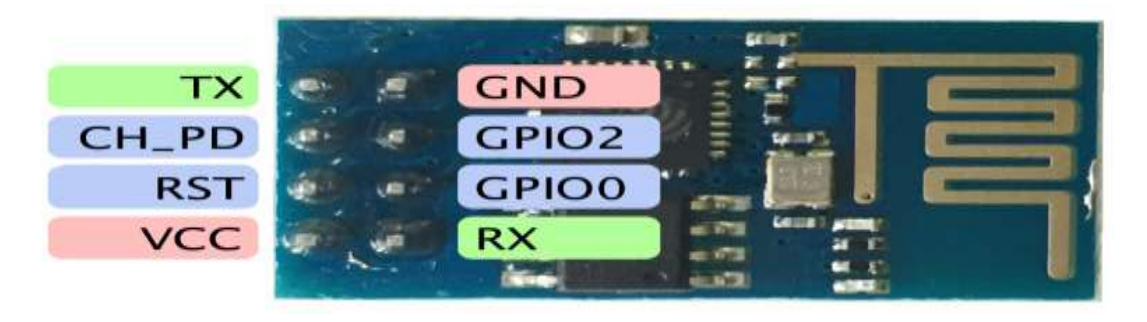
Fig 4: ESP8266

The ESP8266 is a low cost and very user friendly device to provide internet connectivity to your projects. The module can work both as a station (can connect to Wi-Fi) and a Access point (can create hotspot), hence it can easily upload and fetch data, making Internet of Things as easy as possible. It can fetch data from internet using Acess Point Interface hence your project could access any information that is available in the internet, thus making it smarter. It can be programmed using the Arduino IDE is the another exciting feature of this module which makes it a lot more user friendly.