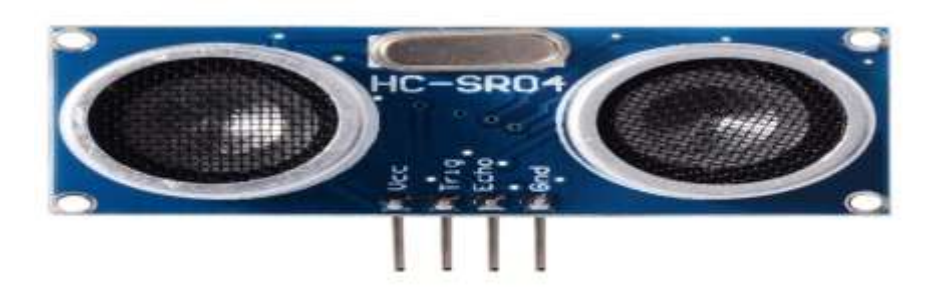
Fig 5: Ultrasonic sensor

HC-SR04 is a ultrasonic distance measurement sensor. It is a type of Acoustic sensor. It provides 2cm to 400cm of non-contact measurement functionality with a ranging accuracy up to 3mm. Each HC-SR04 module includes an ultrasonic receiver, a transmitter and a control circuit. There are only four pins on the HC-SR04: VCC (Power), GND (Ground), Echo (Receive), and Trig (Trigger).