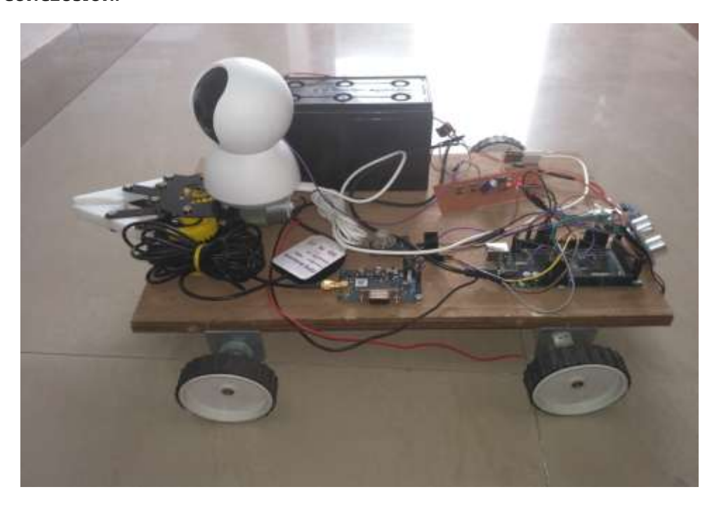
Fig 6: Dual Arm Tele-Robotic System Hardware

In this paper an efficient IoT based dual arm tele-robotic system is implemented. The memory load of the system is reduced due to the use of cloud service. The control commands are successfully transmitted via Wi-Fi and on reception the desired operations successfully take place. Such systems can be brought into use at places such as military, defense, industry and research purposes, etc.