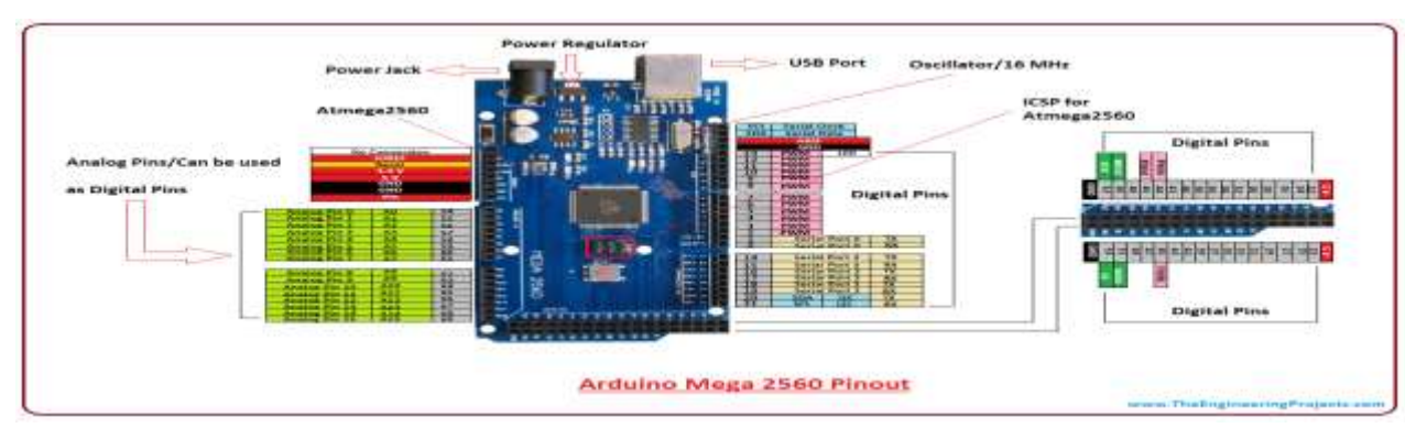
Fig 2: Arduino

Arduino is an open-source computer software and hardware company, user community and work that designs and manufactures kits for building interactive objects and digital devices that can sense and control the physical world. These systems provide sets of digital and analog I/O pins that can be interfaced to various extension board stand other circuits. The boards feature USB on same board, including serial communications interfaces, for loading programs from personal computers. For programming the ICs the microcontrollers, the Arduino platform provides an integrated development environment (IDE) based on the Processing work, which includes support for C++ and C programming languages.