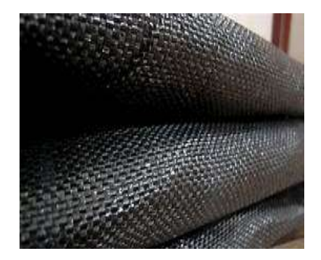
Fig -1 Woven Geotextiles

ask the manufacturer for the guidelines concerned to fabric and proper selection.