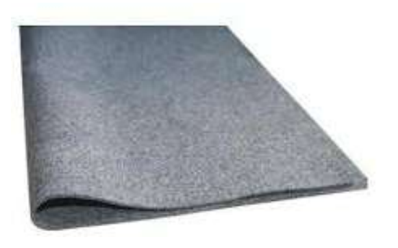
Fig - 2: Non-woven Geotextiles

The size opening is not a critical property with the woven geotextiles as these geotextiles have a wide range of size openings. In general, non- woven geotextiles retain more soil fines than woven geotextiles. Nonwoven geotextiles have rougher surface than that of woven geotextiles therefore the bond between the soil and the geotextiles offers more resistance to sliding along the plane of contact.