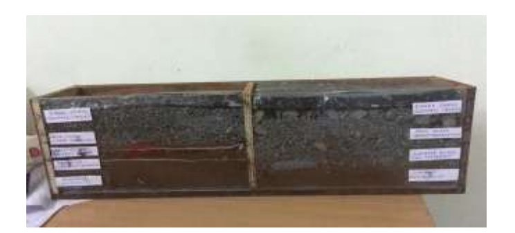
Fig -5: Working Model (Application of Geotextiles)

International Research Journal of Engineering and Technology (IRJET) e-ISSN: 2395-0056 RIET Volume: 06 Issue: 06 | June 2019 www.irjet.net p-ISSN: 2395-0072