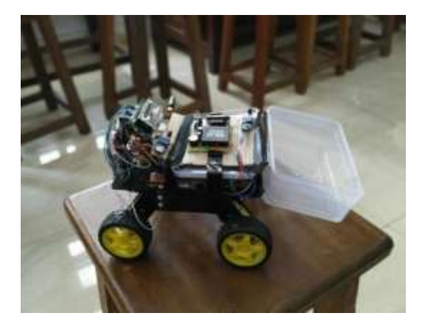
Fig -2: Smart cart