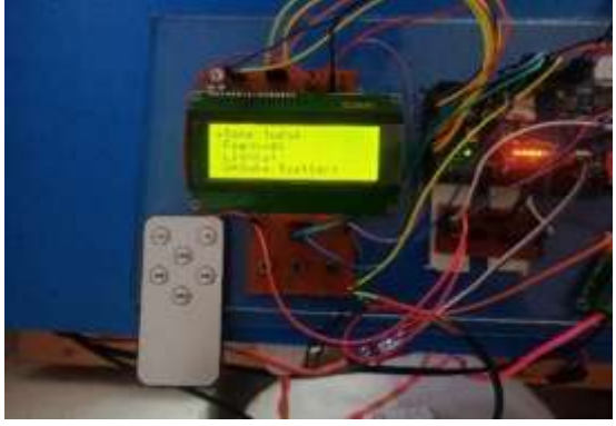
Fig -2: Interfacing Remote to IR sensor

To develop a reliable aquarium monitoring system for users this can be able to send the data about the aquarium to the users on time to time by updating the data to the server. The servo motor is used to feed the fishes in proper time in absence of user. To make it more convenient and easier for users to maintain their aquarium from anywhere around the world.