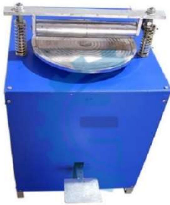
Front View of Papad making machine