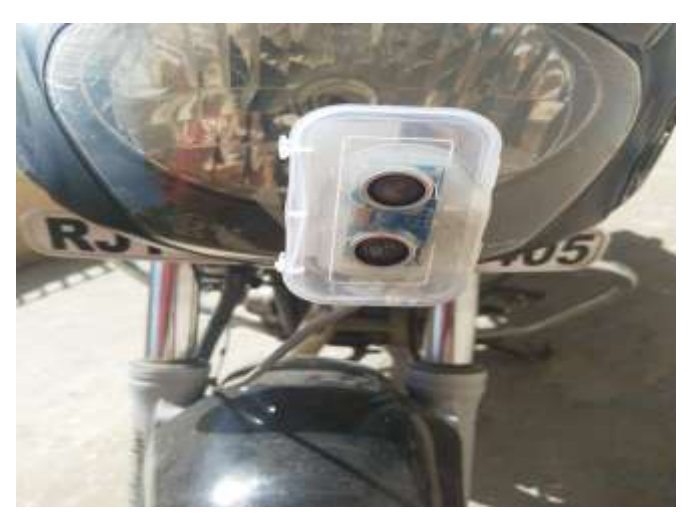
Fig-1 . Ultrasonic Emitter and Receiver Mounted on Motor Bike