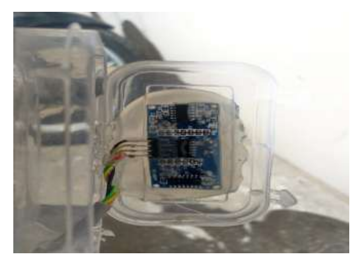
Fig-2. Picture of Smart Braking System Project