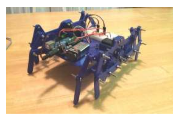
Figure:- A typical Swarm robot working on klann mechanism

Aggregation deals with spatially grouping all robots together in a region of the environment. Aggregation is used to get robots in a swarm sufficiently close together and can be used as a starting point for performing some additional tasks, such as communication with limited range. Aggregation near points of interest can be viewed as the first step of more complex tasks, such as collective transportation where objects of interest need to be transported by several robots. Research in aggregation includes.