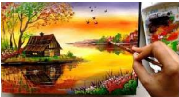
Fig-1: Cover image(image is in RGB format)