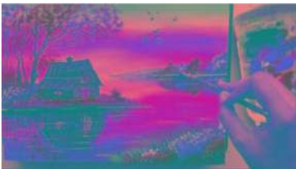
Fig-2: YCbCr image