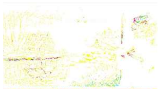
Fig-6: Modified Cb component