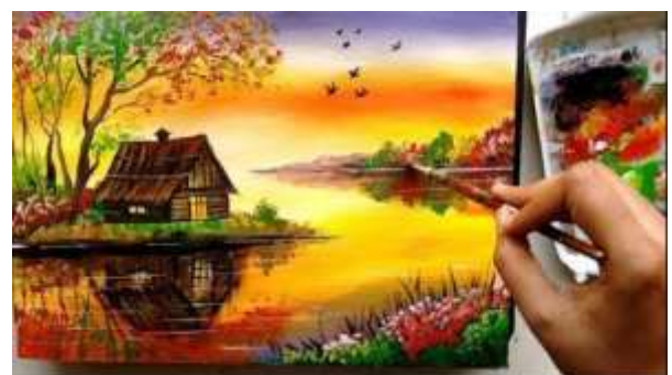
Fig-7: Stego image