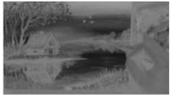
Fig-4: Cb component