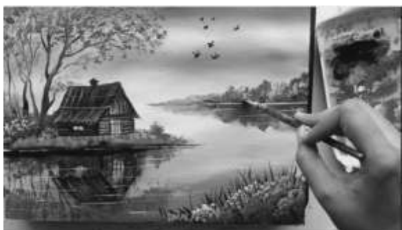
Fig-3: Y component