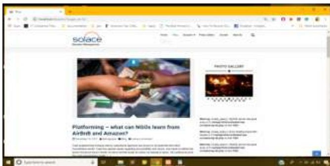
Fig -5: Blog Page

In this page, we have an user interactive map where we just have to type the area and we will get all nearest NGO's in that area along with their address and contact details.