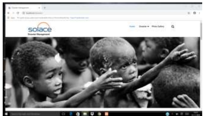
Fig -2: Home Page

Following figures shows some live screenshots: