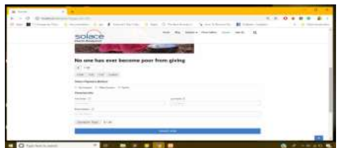
Fig -3: Donation Portal Page

This is the how our home page looks in the beginning. There are all the links in the top right corner. Though, not in the picture but as we scroll down we can see map of India representing disaster prone areas also we have links which lead to news about the latest disaster.