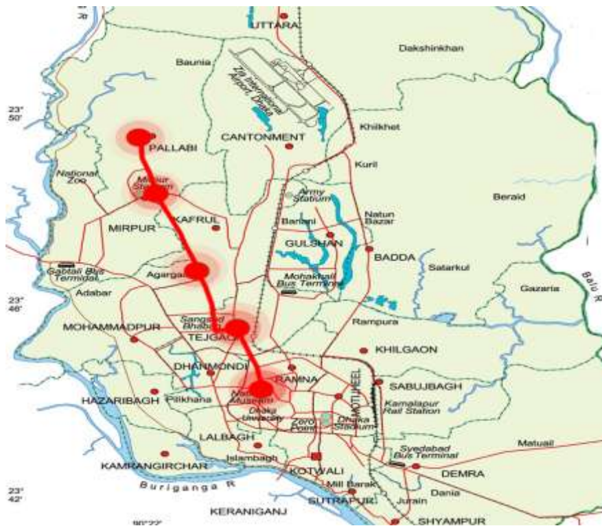
Fig 1 : Selection of five public places for noise measurement