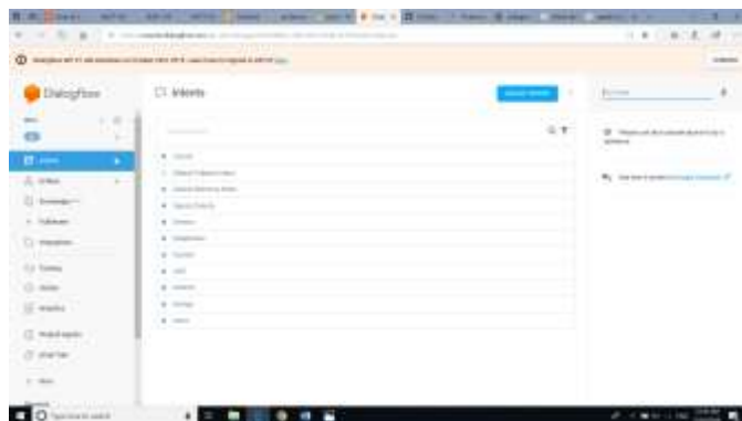
Fig 4: User utterance is matched with an intent, extracts parameters, and returns a response.