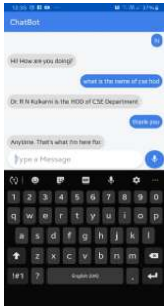
Fig 2: Chatbot Android app