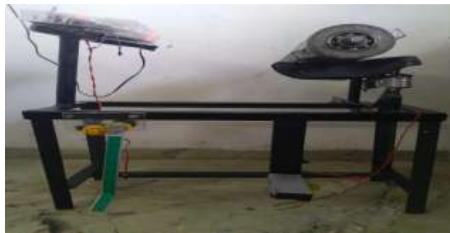
Fig: 1 Side stand and foot rest retrieving system

Assembly of side stand and foot rest retrieving system is shown in Figure 1.