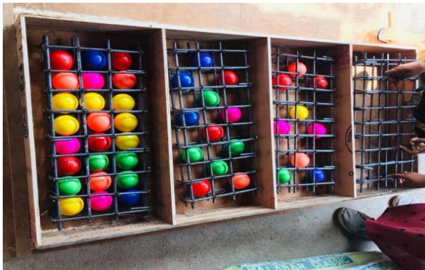
Fig.1: Arrangement of balls and reinforcement

The main purpose of inclusion of steel is to resist tensile stress in particular regions of the concrete that may cause structural failure or cracking. The steel reinforcement is of Grade Fe415 strength.