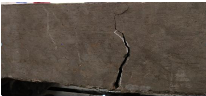
Fig.5: Cracks developed in bubble deck slab with 9 Nos balls