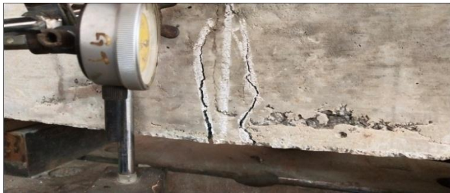
Fig.4: Cracks developed in conventional slab

Loading of slabs are carried by universal testing machine. As the loading progress cracks are developed on the slabs when the loading reaches the rupture strength of the concrete. As the loading increases intensity of cracking also increases. The crack patterns developed on all slabs are identified. Crack patterns of conventional slab and that of bubble deck slabs are shown in fig 3.