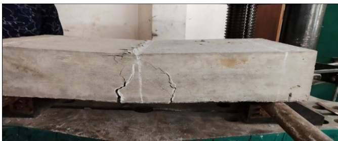
Fig.6: Cracks developed in bubble deck slab with 12 numbers of balls