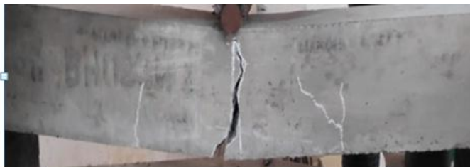
Fig.7: Cracks developed in bubble deck slab with 24 numbers of balls