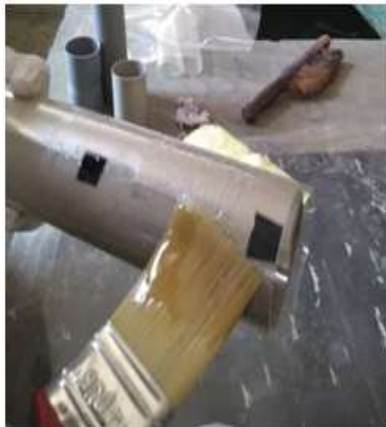
Fig - 2. Application of Matrix

Next an adequate quantity of mixed resin & hardener is deposited in the mold and a brush or roller is used to spread it around all surface, It is important not to add too much resin, which will cause too thick of a layer, nor to add less than the necessary amount, which will cause holes in the surface of the part when it is cured.