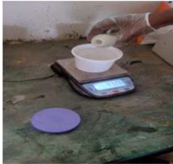
Fig - 1 Measurement of Epoxy mixture

Next an adequate quantity of mixed resin & hardener is deposited in the mold and a brush or roller is used to spread it around all surface, It is important not to add too much resin, which will cause too thick of a layer, nor to add less than the necessary amount, which will cause holes in the surface of the part when it is cured.