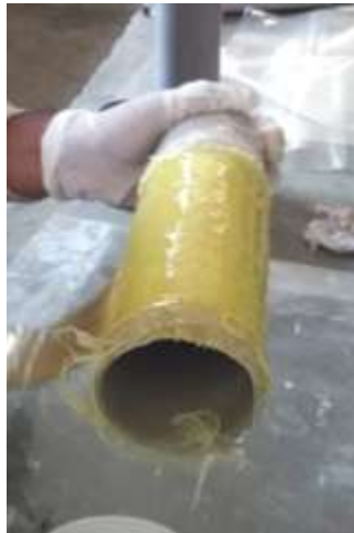
Fig - 3. Wrapping of Fiber

After this stage a second layer of Glass fiber is added and special care must be taken to eliminate all air bubbles possible. This can be accomplished by either rolling or brushing out the bubbles formed. This step is repeated until the desired configuration is obtained. As the fiber layers are added to build laminates and total part thickness. After the final layer of fiber is placed an outer coating of resin is made and release film is wrapped on it and secured with the adhesive tape.