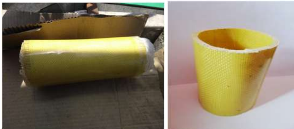
Fig - 4 Finished Component

Once that part is ready and cured, it must be removed from the mold and excess materials must be trimmed off, and also as post curing process the part can be cut to required shape and dimensions.