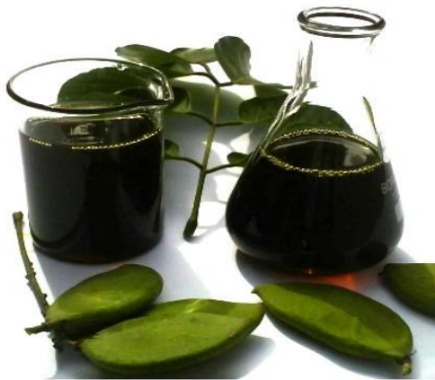
Fig- 1: Pongamia oil

erosion. Its root, bark, leaves, sap, and flowers also have medicinal properties and are traditionally used as medicinal plants. The seeds are largely used to extract oil known as 'Karanja oil'