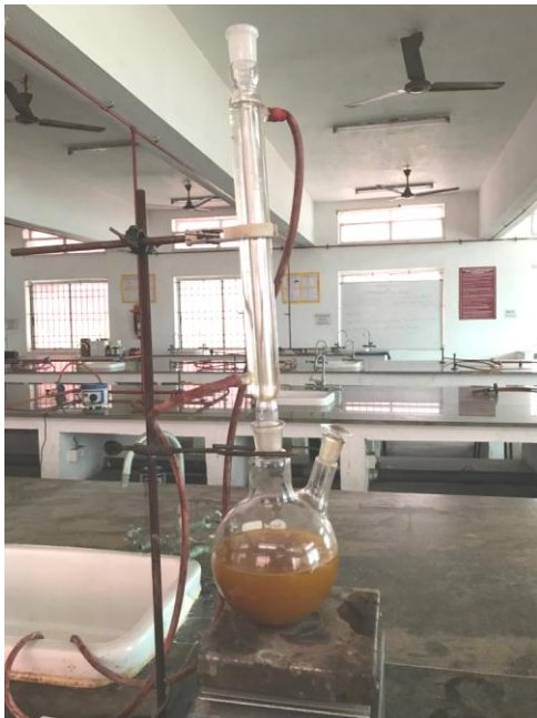
Fig -3: Biodiesel synthesis by transesterification