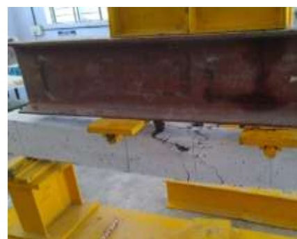
Fig 4.6 Flexural strength of beam