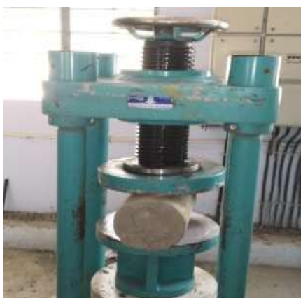
Fig 4.7 Split tensile strength test