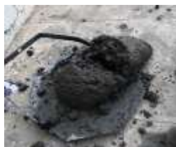
Fig 4.3 Collapsed slump