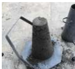
Fig 4.1 True slump

Slump test is the most usual method of measuring concrete consistency that can be used either in the laboratory or in the workplace. Slump is a measure that indicates cement concrete's consistency or workability. Bottom diameter= 200 mm, top diameter= 100 mm and height= 300 mm, however, it is conveniently used as a control test. The slump cone test value was found to be 78 mm for 0.43 water cement ratio. For this investigation, therefore, this ratio is used. Figure 4.1, Figure 4.2 and Figure 4.3 show the slump cone test.