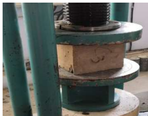
Fig 4.5 Compressive strength test