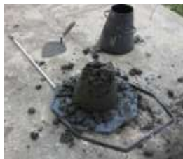
Fig 4.2 Shear slump