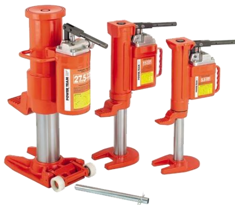
Fig-4 Toe hydraulic jack

Hydraulic toe jacks are a specialized jack for lifting or jacking masses with low clearance heights. Toe jacks as the decision implies characteristic a low foot or toe casting this is lifted by means of way of an internal hydraulic jack. They're in particular beneficial for lifting and positioning of heavy device or loads. They can also be used for lifting forklifts or low clearance equipment. Provided in pretty various capacities our toe jacks are immoderate excellent, durable, are from professional corporation proven manufacturers.