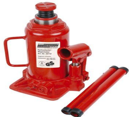
Fig-1 Bottle hydraulic jack

In a bottle jack the piston is vertical and directly helps a bearing pad that connects the gadgets being lifted. With an unmarried action piston the elevate is fairly less than twice the collapsed peak of the jack, making it suitable handiest for the cars with an exceptionally high clearance. For lifting systems including homes the hydraulic interconnection of multiple vertical jacks through the valves enables the even distribution of forces whilst permitting near manipulate of elevate.