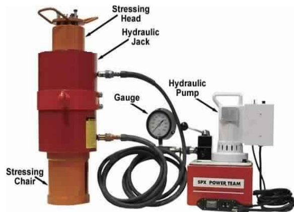
Fig-3 Strand hydraulic jack