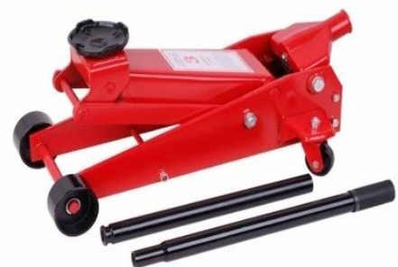
Fig-2 Hydraulic floor jack

In a floor jack a horizontal piston pushes on the short end of the bell crank, with the long arm providing vertical motion to the lifting pad, kept horizontal with horizontal linkage. Floor jacks usually include castors and wheels, allowing compensation for arc taken by the lifting pad. This profile provides low profile when collapsed, for easy operating underneath the vehicle while allowing considerable extension.