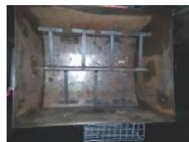
Fig 4. Stirrer of PCM

The process of compost in PCM follows the Aeration method of Composting.