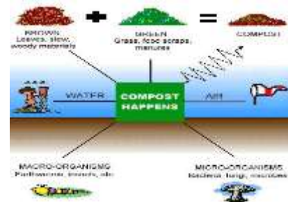
Fig -1: Composting process

scraps, and trusting that the materials will separate into humus following a time of months.