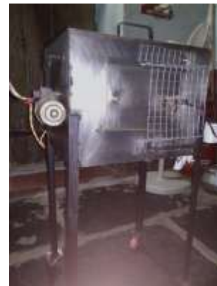
Fig 3. Portable Compost Machine