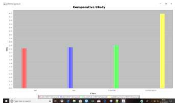
Fig-3 Bar chart of overall performance