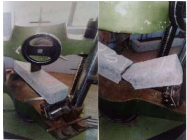
Fig.4.6 Flexure Strength Test