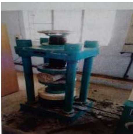
Fig.4.5 Split Tensile Strength Test