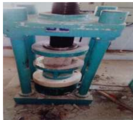
Fig.4.4 Compressive Strength Test