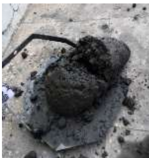
Fig.4.3 Collapse Slump