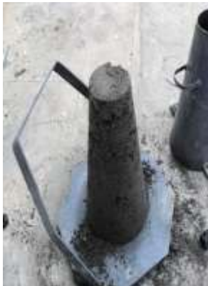
Fig.4.1 True Slump

The workability is one of the concrete’s parameters that disturb the strength and durability and finished surface appearance. Concrete workability is based on the water cement ratio and the water ingestion limit if the aggregates. If additional water results in bleeding or aggregate segregation. The test for concrete workability is performed by the Indian Standard IS 1199-1959 which allows the test procedure to use different cases in which we used slump cone tests to estimate concrete workability. We estimated the concrete cone status for different water cement ratios and recorded the values for normal concrete. Then the same procedure is performed with sand being completely replaced by the concrete with river sand, M-Sand and Quarry Dust Sand.