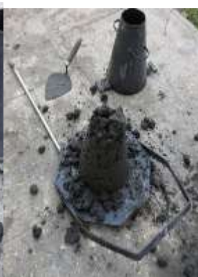
Fig.4.2 Shear Slump