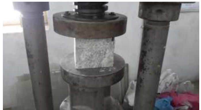
FIG-1: Cube specimen under compressive testing machine

Compressive strength = load at failure / area of cross section in N/mm 2 .