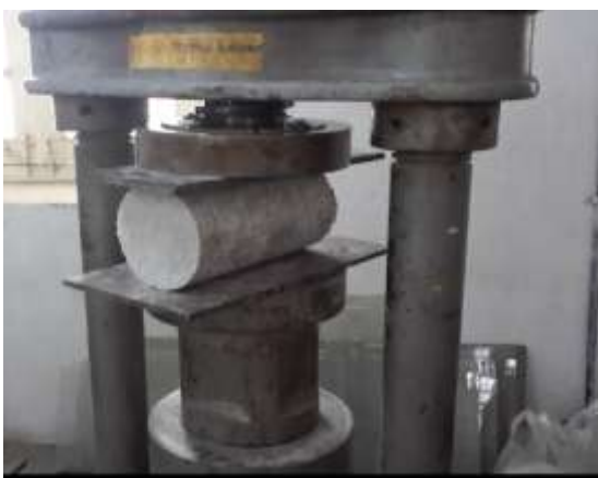
Fig 2: The Split Tensile Strength test setup