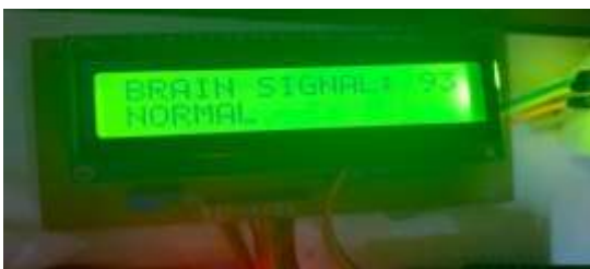
Figure 2 LCD when patient is in Normal State

Upon the onset of narcoleptic sleep the EEG sensor detects it and sends it to the microcontroller. Then the vibrational motors are made to vibrate which wakes up the patient. The accelerometer sensor also detect a fall and it checks with the EEG sensor whether the person is experiencing narcoleptic sleep and if they are, then a message will be sent containing the location of the patient unless they press a button within a time window after falling. The attention values are indicated in a LCD monitor and the type of sleep is also indicated. The various brain waves can also be observed using Labview software.