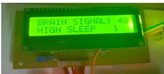
Figure 3 LCD when patient is in High Sleep State

The figure 2 shows the output displayed at LCD when the EEG detects the patient to be in Normal state.