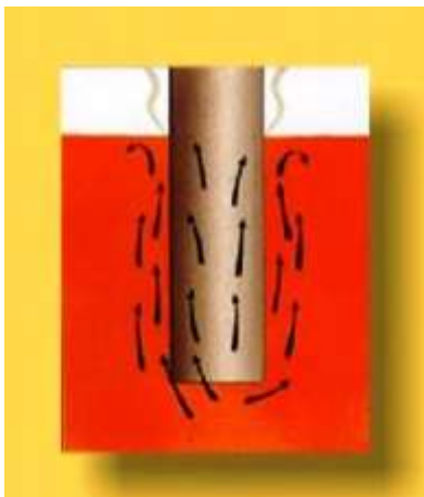
Figure-3: Convective Heat Transfer [1]

The last stage of quenching is the convection stage. This occurs when the test probe has reached a point below that of the oil's boiling temperature.