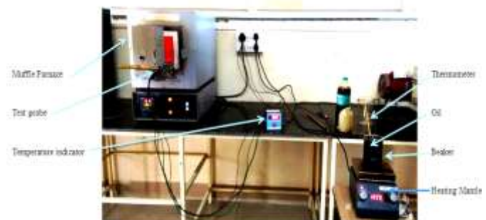
Figure-4: Experiment Overview