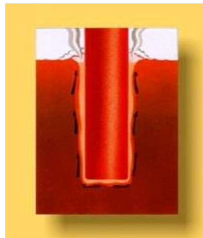
Figure-1: Vapour Blanket [1]

The vapour stage is obtained when the hot surface of the heated test probe comes in contact with the liquid quenchant (oil). It becomes surrounded with a blanket or layers of vapour. In this stage, heat transfer is slow. It occurs most significantly by the radiation through the vapour blanket. Some other conduction also occurs through the vapour phase.