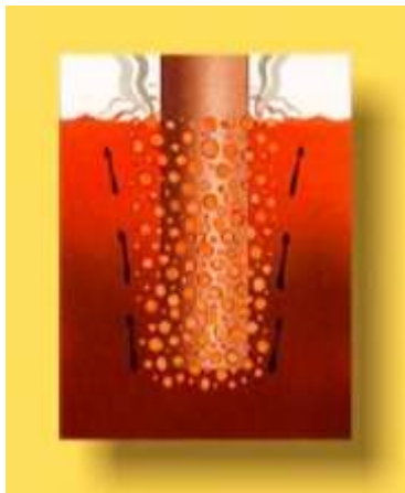
Figure-2: Nucleate Boiling [1]

exhibits little or no vapor stage, a rapid nucleated boiling stage and a slow rate during convective cooling.