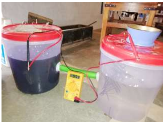
Fig.3.2 Model of MFC

Results:- Here are two results obtain from tests,