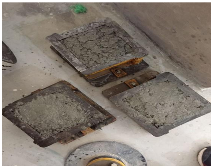
Fig.6: Molding of Bricks

The resistance of a material to not break under compression is called compressive strength.