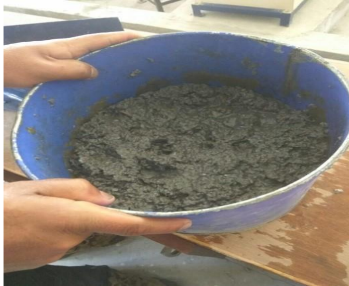
Figure.2: Paper Pulp