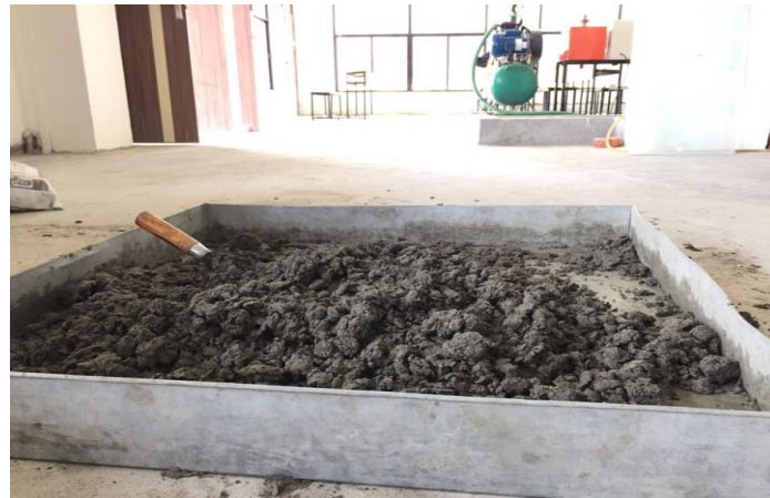
Fig.3: Mixing of Ingredients

The pulp was then added with dry ingredients and mixed uniformly manually. After mixing, concrete blocks were casted for testing and other various tests were performed with the mixes.