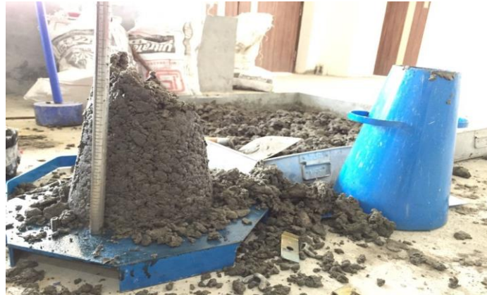
Fig.4: Slump of Papercrete

The slump value for the papercrete samples was found out to be P1=78 mm and P2=83mm.