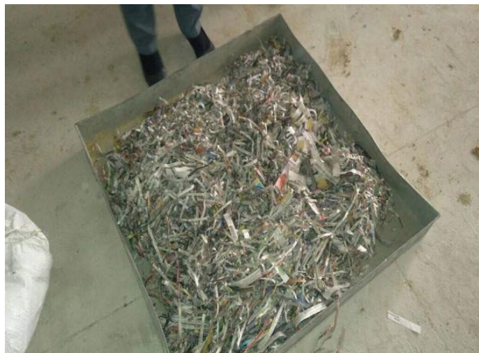
Figure.1: Shredded Paper.

After the period, the paper is taken out from water and converted into pulp (Figure.2).