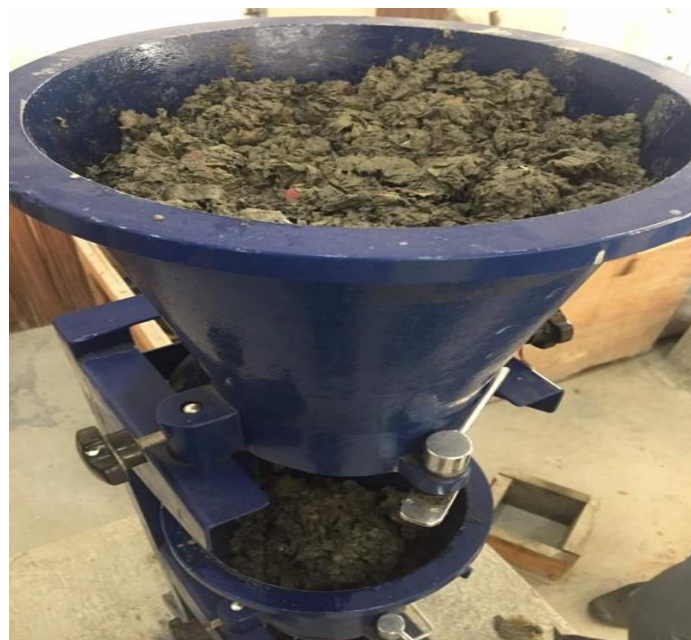
Fig.5 (a): Compaction Factor Apparatus

The compaction factor of papercrete was found out to be P1=0.87 and P2=0.84