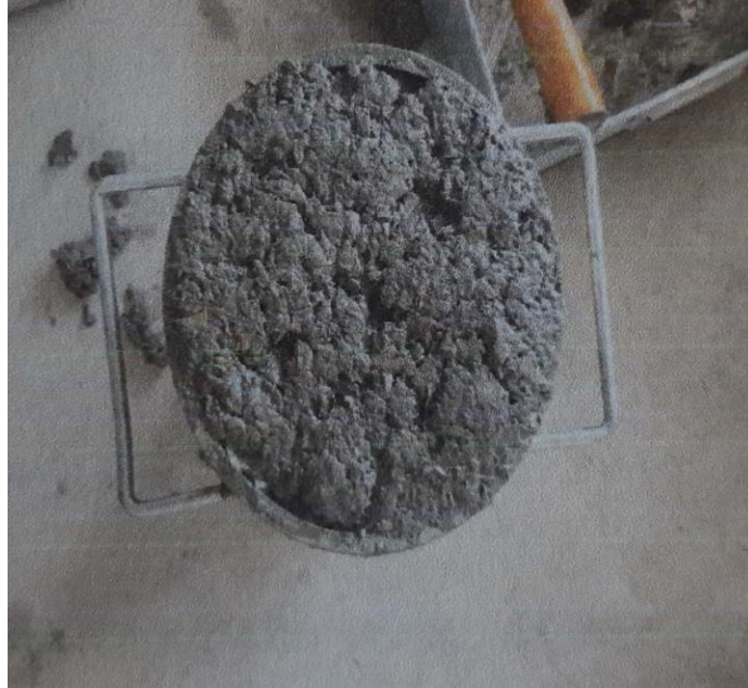
Fig.5 (b): Compaction Factor Cylinder