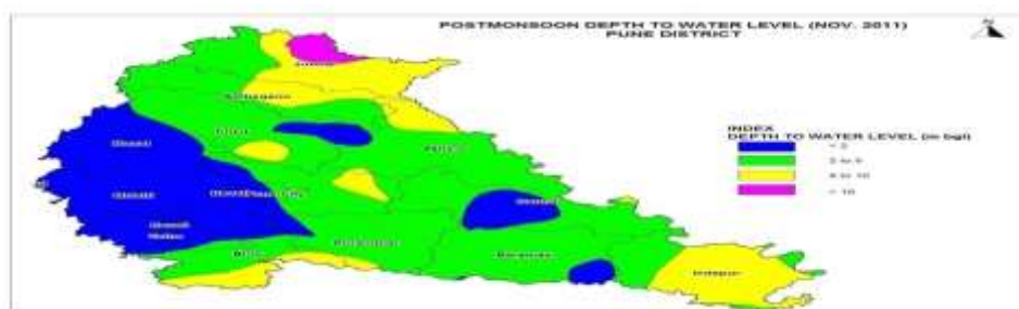
Figure 3. Postmonsoon Depth to Water Level (Nov. 2011)

The depth to water level in district during post-monsoon (Nov.2011) varies from 0.65 at Dorlewadi to 15.65 m bgl at Latur.