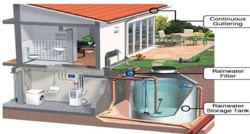
Figure 1. Components of Rainwater Harvesting

In this chapter, we discuss about the various methods adopted. All the methods of rainwater harvesting system is to be discuss with proper explanation and representation.