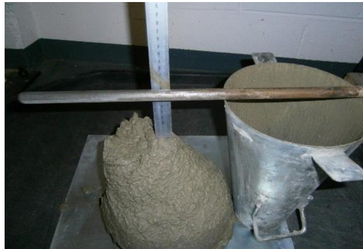
Fig 4.1- slump cone test