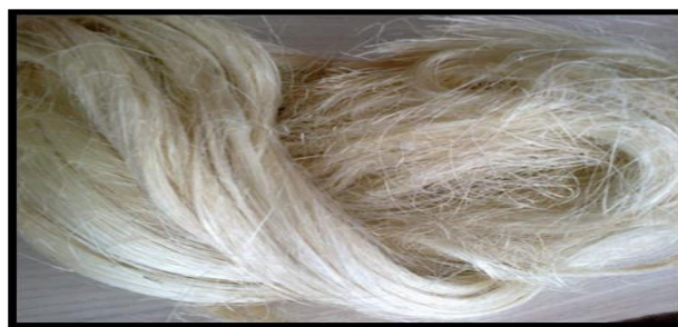
Fig. 1.1- sisal fibre

Vegetable fibres, including sisal, coconut, jute, bamboo and wood fibres, are prospective reinforcing materials and their use until now has been more empirical than technical. They have been tried as reinforcement for Cement matrices in developing countries mainly to produce low-cost thin elements for use in housing schemes.