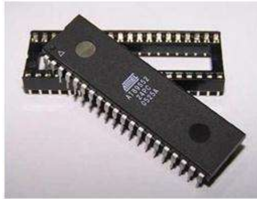
Fig-2: Microcontroller (AT89S52)