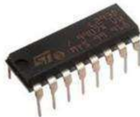
Fig-3 : Motor Driver

The AT89S52 provides the following standard features: 8K bytes of Flash, 256 bytes of RAM, 32 I/O lines, Watchdog timer, two data pointers, three 16-bit timer/counters, a six-vector two-level interrupt