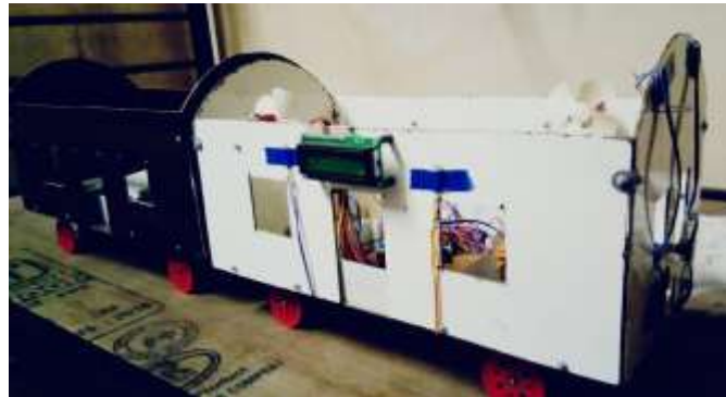
Figure No. 6 Project Photo 1

So 6.25 kwh of energy is saved on one platform for one day.