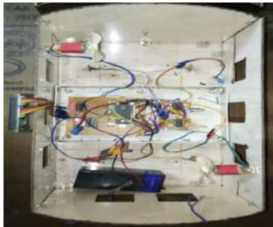
Figure No 7: Project Photo 2