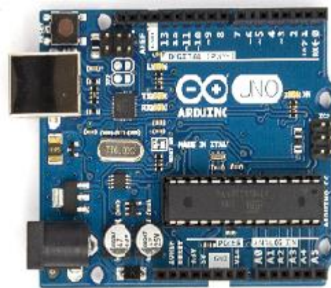
Fig. Arduino UNO

The Arduino is an open source, which means hardware is reasonably priced and development software is free. The Duemilanove board features an Atmel Atmega328 microcontroller operating at 5V with 2kb of RAM, 32 kb of flash memory for storing programs and 1 kb of EEPROM for storing parameters. The clock speed is 16 MHz, which translates to about executing about 30,000 lines of C source code per second. The board has 14 digital I/O pins and 6 analog input pins. There is a USB connector for talking to the host computer and a DC power jack for connecting an external 6-20V power source, for example 9V battery. When running a program while not connected to the host computer. Headers are provided for interfacing to the I/O pins using 22 g solid wire or header connectors.