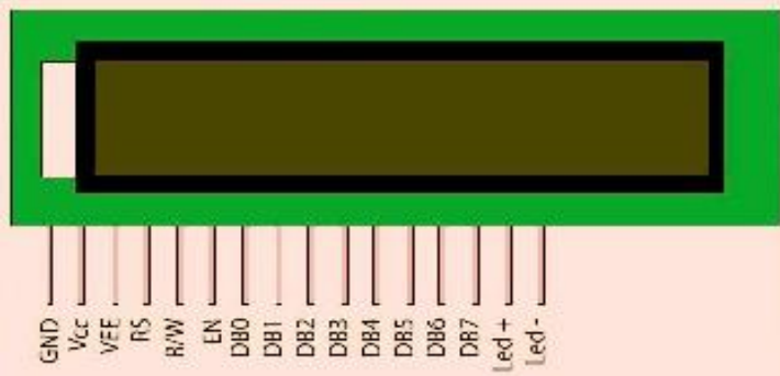
Fig. LCD display

A liquid-crystal display (LCD) is a flat panel display, electronics visual display, or video that uses the light modulating properties of liquid crystals. Liquid crystals do not emit light directly.LCD's are available to display arbitrary images or fixed images which can be displayed or hidden, such as a preset words, digits, and 7-segment displays or hidden, as in digital clock.In our system LCD display is used to display the longitude and latitude which are associated with the current location of the vehicle