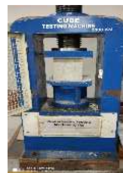
Fig 1: Compression strength test for cube