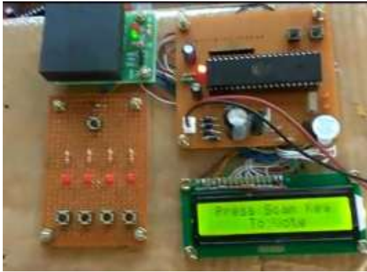
Fig -4: Output

case, storing them as array of strings might not work. We may need to employ a database management system to hold the record and retrieve the data quickly. Besides that, external memory will be required to hold such database.