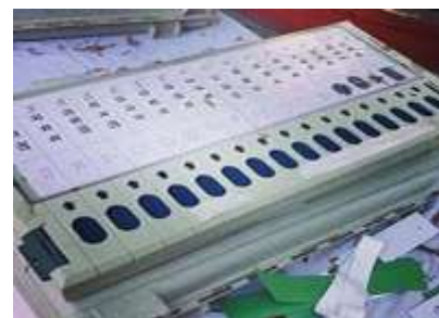
Fig -1: Electronic Voting Machine

When there was ambiguity over the election results recently regarding faults in EVM, losing parties asked for traditional paper ballot voting process. In a country like India where the election process happens over a long period of time care should be taken that votes are preserved till the results are announced. If traditional paper ballot process is employed, there are chances of manipulation in various ways. In order to overcome this drawback, EVM was developed which again has many issues like mechanical faults, overwriting the stored data, vote of no confidence. The major drawback in this process is lack of efficiency in counting the votes, dependency on human resource and entertains tampering of votes. Electronic voting machine is more efficient than paper ballot process in terms of cost effectiveness since latter uses more usage of paper. EVMs are user friendly as voting process is made easy through push buttons. Votes casted in different centers using EVMs can be uploaded onto a single central unit which makes easier to announce the results. Even this e-voting machine has a lot of disadvantages. Several security analysts have rejected EVMs as they are vulnerable to hackers which challenge the efficiency of the machine. Vote of no confidence is another disadvantage, where the voter is ignorant about his vote. Button jamming, cross voting are various other drawbacks in this system.