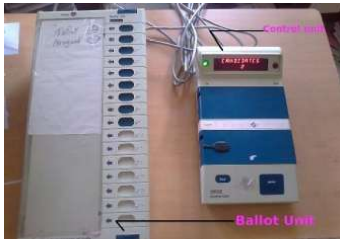
Fig -2: Ballot unit (left), Control unit (right)

an existing candidate or party. The goal is to mislead voters into voting for the false candidate or party to influence the results. Such tactics may be particularly effective when a large proportion of voters have limited literacy in the language used on the ballot. Again, such tactics are usually not illegal but often work against the principles of democracy.