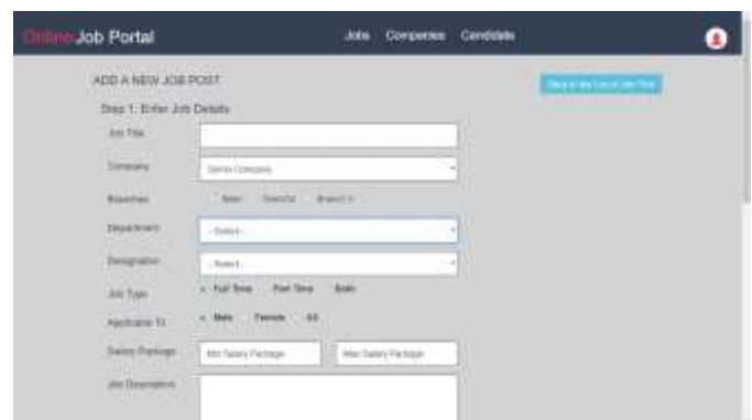
Fig - 5: New Job Post Detail Requirements (2/2)