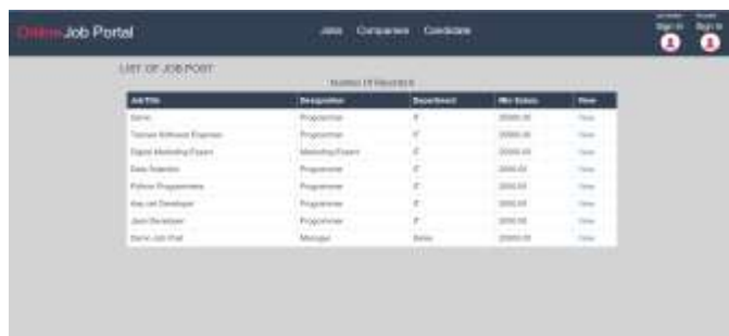
Fig - 2: List of Job Posts