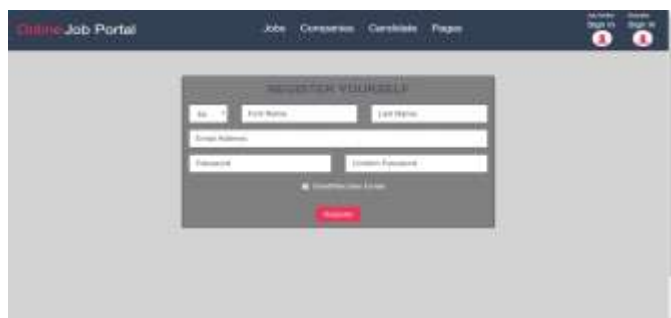
Fig - 3: Job Seeker Login