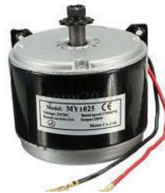
Fig – 1: PMDC Motor

Permanent magnet DC motors (PMDC motors) consist of permanent magnets, located in the stator, and windings, located in the rotor as shown in Fig 1. The ends of the winding coils are connected to commutator segments that make slipping contact with the stationary brushes. Brushes are connected to DC voltage supply across motor terminals. Change of direction of rotation can be achieved by reversal of voltage polarity. The current flow through the coils creates magnetic poles in the rotor that interact with permanent magnet poles. In order to keep the torque generation in same direction, the current flow must be reversed when the rotor north pole passes the stator south pole. For this the slipping contacts are segmented. This segmented slip ring is called commutator.