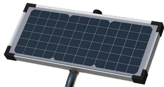
Fig – 4: Solar Panel

Dimensions 397 x 278 x 25mm Weight - 1.6kg