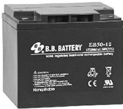
Fig – 2: Lead Acid Battery

throttle has three wires contains a black, red, and green. The supply voltage is via red and black wires and is usually around 4 volts. Green wire voltage increases as the throttle is turned.