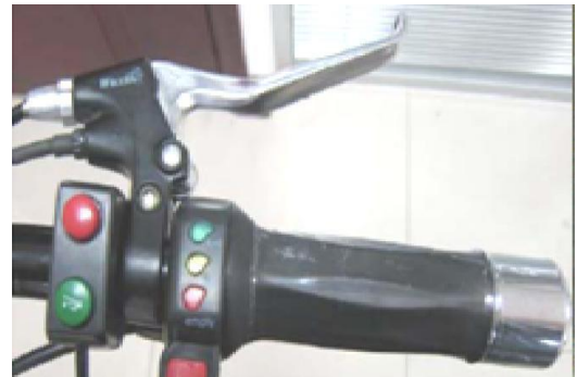
Fig – 3: Throttle

throttle has three wires contains a black, red, and green. The supply voltage is via red and black wires and is usually around 4 volts. Green wire voltage increases as the throttle is turned.